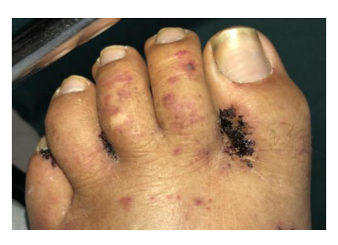
Figure 2: Interdigital dried hemorrhagic bullae.

Laboratories showed multiple disturbances. The complete blood count (CBC) was pertinent for normocytic anemia of 10.5g/dL with a mean corpuscular volume (MCV) of 86.2, thrombocytosis of 614 Thou/uL, and eosinophilia 18.7% on the differential. The coagulation panel showed prolonged PT 54.2 sec and PTT 79.5 sec, resulting in a supra-therapeutic INR of 5.06. The chemistry showed results compatible with intrinsic acute kidney injury with an elevated Creatinine 2.20 mg/dL, compared to 1.30 mg/dL upon discharge one month prior, and a BUN:Cr ratio of 17.7. Urinalysis showed macroscopic and microscopic hematuria (RBC over 50) and proteinuria of 25 mg/dL with WBC 3-9/hpf without casts. Urinary protein excretion was estimated with a urine protein to creatinine ratio of 1.4g/day. Rheumatoid factor was elevated at 16.50 IU/mL and serum cryoglobulin was positive. The patient also presented the following laboratory disturbances: an elevated: ESR 120mm/h, C3 192mg/dL, and C4 89mg/dL. Serologies for MPO, PR3, Human Immunodeficiency Virus and Hepatitis B and C were all negative. An abdominal ultrasound was pertinent for symmetric and normal sized kidneys with increased cortical echogenicity favoring parenchymal renal disease.