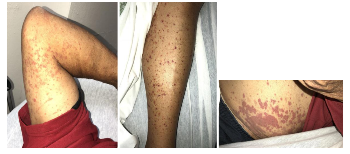
Figure 1: Maculopapular non-blanching purpuric lesions of upper and lower extremities and flank.

On initial physical examination, there was an active and alert, oriented x3 male patient with normal vital signs. However, examination of the skin showed a non-blanching purpuric rash in bilateral forearms, flanks, and lower extremities [Figure 1]. An interdigital small, dried hemorrhagic bulla [Figure 2] was present on the left foot's first interdigital space, and the extremity had swelling to the level of the thigh, with erythema, and tenderness. The rest of the physical examination was otherwise unremarkable.