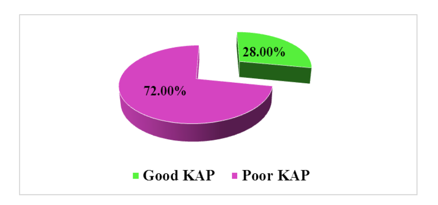
Figure 2: Respondent's KAP about antibiotic use.