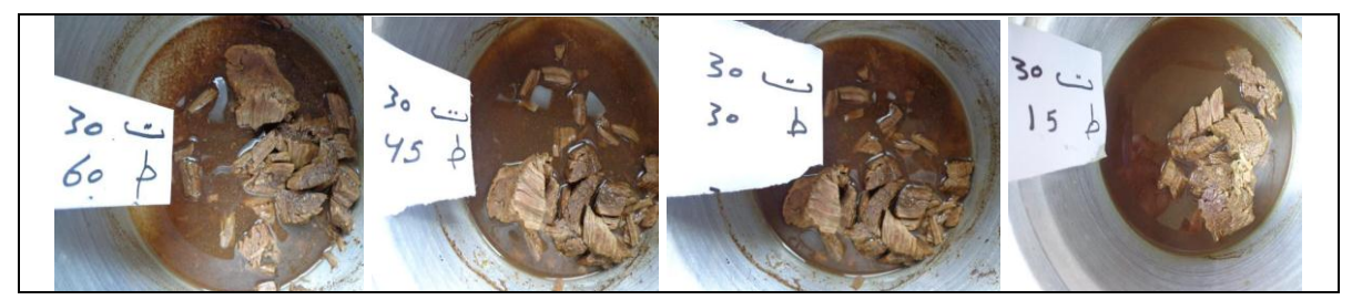
Figure. (2): Soaked beef meat samples (30 min), and long cooking (15-60 min) compared with Control samples.

Based on the comments of the sensory panel, the meat was somewhat mushy and grainy like chopped liver. Also, it had a slightly bitter taste, perhaps due to the breakdown of some of the protein fibers to amino acids like L-tryptophan & L-tyrosine.<sup>[4]</sup>