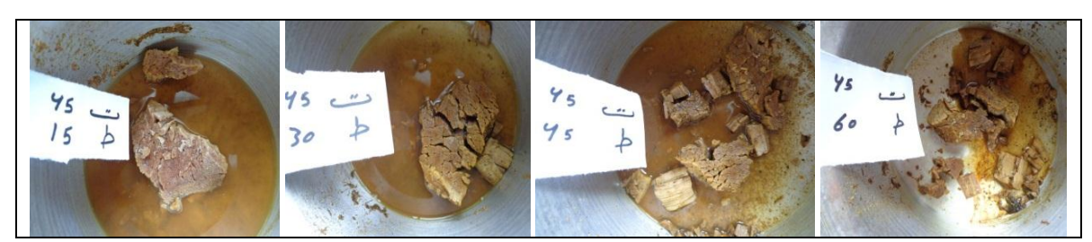
Figure. (3): Soaked beef meat samples (45 min), and long cooking (15-60 min) compared with Control samples.