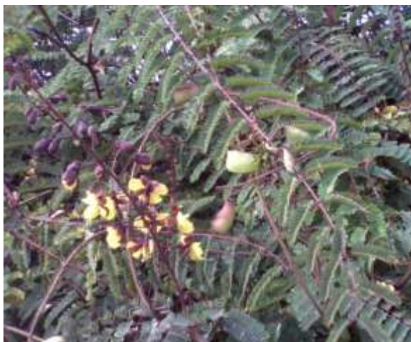
Figure 1: Caesalpinia mimosoides Lamk.

It has been experimentally shown that the extracts and purified compounds of C. mimosoides exhibit many bioactivities. The methanolic extract of shoot tips was shown to exhibit antioxidant activity [24] . The aqueous extract and a purified compound gallic acid showed potent inhibitory activity against human bacteria and fungi [25] . The leaves showed in vivo antiarthritic and analgesic activities [21] . Diterpenoids isolated from roots exhibited anti-inflammatory activity in terms of inhibitory activities against lipopolysaccharide induced nitric oxide production and inhibitory effect on LPS-induced tumor necrosis factor-alpha release in RAW264.7 cells [26] . Quercetin isolated from ethyl acetate extract of aerial parts enhanced survival and induced neurite outgrowth of P19-derived neurons [20] . The stem extract was shown to exhibit antimicrobial and antioxidant properties [27] . Polyphenolic fractions from aerial parts inhibited viability of cervical carcinoma cell lines in a dose and time dependent manner [28] . In the present study, we determined antimicrobial (against drug resistant uropathogenic bacteria and phytopathogenic fungi) and radical scavenging efficacy of root, leaf, flower and fruit extract of C. mimosoides .