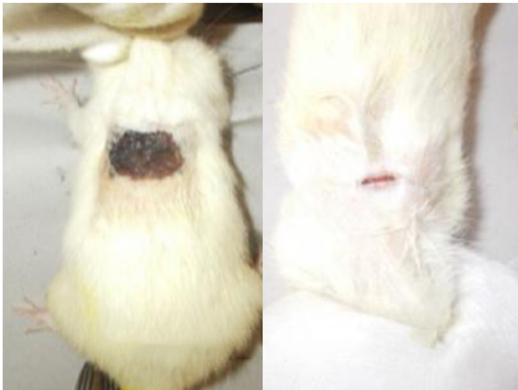
Fig. 3. Wound of Test group 4 th day (19/3/2015) and 16 th day (31/3/2015).

promotes angiogenic responses in wounds in both in vitro in vivo models [24]. Several copper-dependent enzymes, mainly amine oxidases, are known to be increased during wound healing. These copper-dependent enzymes are important in the remodeling and healing of the wounds [25]. Sphatika (Potash Alum) possess astringent and hemostatic properties and helps in the tissue contraction and reduces inflammation there by enhances wound healing [26]. Shodhitakasisa is known to possess krimighna (Antimicrobial) and vranaghna (wound healing) properties [27]. Recent researches showed similar wound contraction rate of polyherbal fractions of Clinacanthus nutans and Elephanto pusscaber when compared to PK [28]. A study conducted on polyherbal formulation showed similar results on excision wound healing model [17,29,30]. This emphasizes that, the test drug has started showing the wound healing effect from the initial day of the wound.