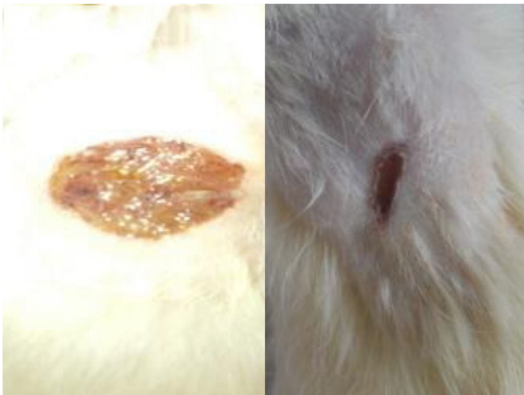
Fig. 1. Wound of Control group 4 th day (19/3/2015) and 16 th day (31/3/2015).