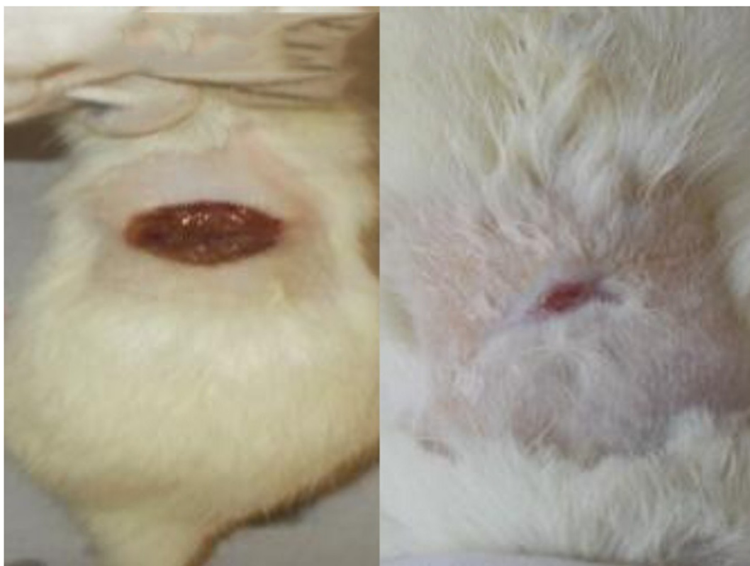
Fig. 2. Wound of Standard group 4 th day (19/3/2015) and 16 th day (31/3/2015).