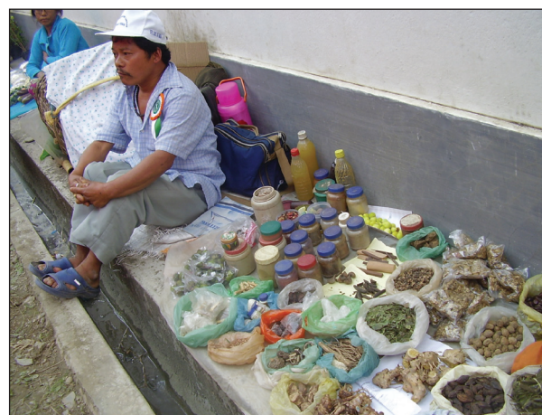
Figure 2: Folk healer of Sikkim