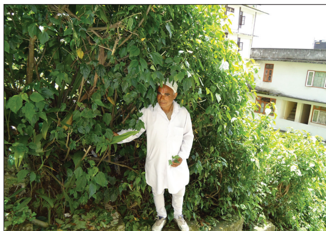
Figure 1: Traditional folk healer of Chengay Lakha, East Sikkim .

Of Sikkim's rich plant biodiversity, the 31 medicinal plants in the table 1 are the most used in traditional healing practices. Scientific validation, reverse pharmacological and observational studies are required for them, and for the various belief-based treatments of the three Sikkim communities. Then, this traditional knowledge could be utilized for primary health care, and to generate employment. Sikkim's folk traditions are gradually declining in this Trans Himalayan region, as few in the new generation are coming forward to adopt folk healing practice as a profession. There is a significant shift in the socioeconomic pattern of so the folk healers of Sikkim , the department of AYUSH is actively trying to revitalize Sikkim's local health traditions and folk healing practices by conducting training workshops and seminars. The challenges are to educate folk healers about their weaknesses and strengths, to attract young stars to adopt this profession by means of monetary benefits, and to preserve the knowledge and