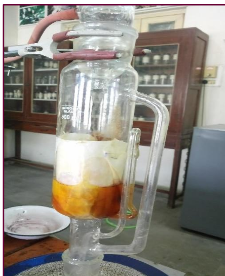
Fig 3 Extraction through Soxhlet Apparatus