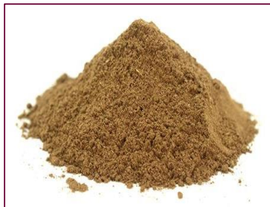
Fig 2 Flower Powder