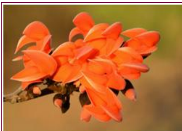
Fig 1 Flower