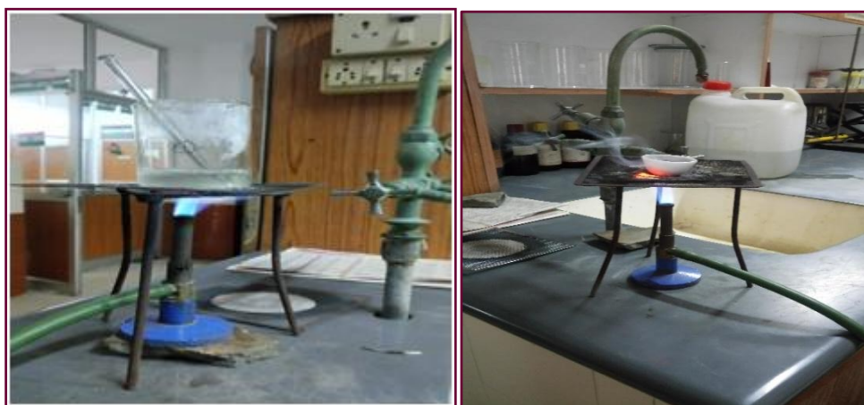
Fig 4 Ash Value Determination